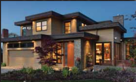
RUNNEYMEDE Modern Contemporary