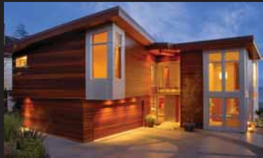
RADIUS Modern West Coast Contemporary