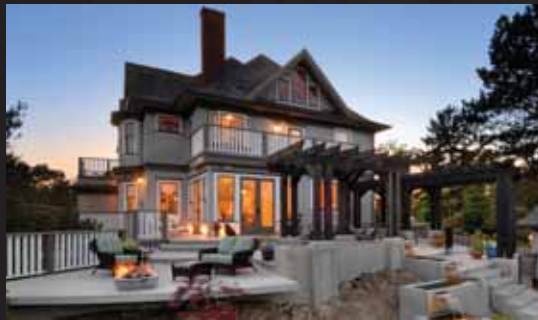
GRIFFITH Distinguished British Tudor