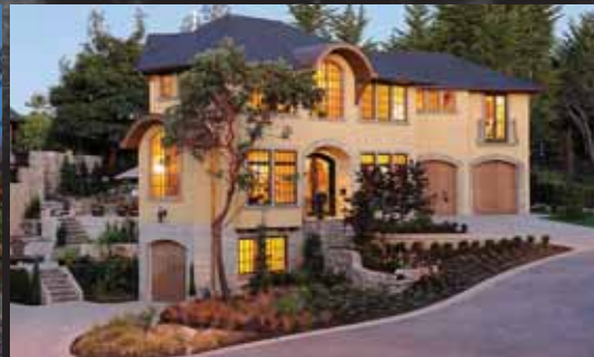
MONTEBELLO Tuscan Inspired