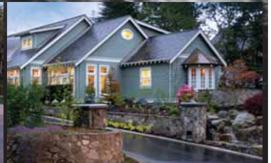
WESTCOTT Classic "English Cottage"