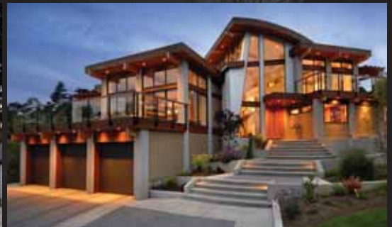
ARMADA Sophisticated Curvaceous Contemporary